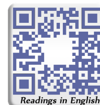
Readings in English

Saturday: Jer 11:18-20/Ps 7:2-3, 9bc-10, 11-12/Jn 7:40-5