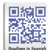
Readings in Spanish